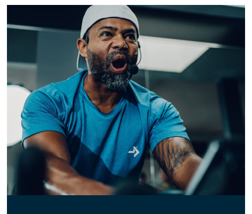
Group Fitness Instructor